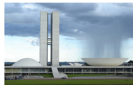
A view of Brazil’s National Congress.

Along with increased political involvement, Brazil’s economy is now the most important in the region. Thanks to its recent growth, Brazil is around 60% of the regional GDP. 71 Brazil is using some of this wealth to