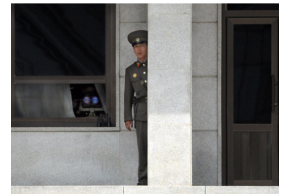
DPRK Guard peers out from behind a granite pillar.

One school of thought on North Korea's steps toward net access proposes that the regime uses extremely limited IT implementation to enforce its control of the