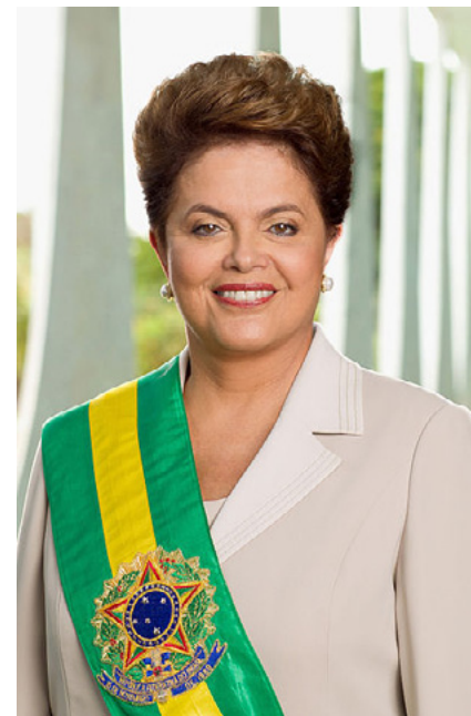
Brazilian President Dilma Rousseff

In essence, China has carved out a space for itself in through economic prowess and investment. It has also "noticeably intensified its diplomatic engagement with