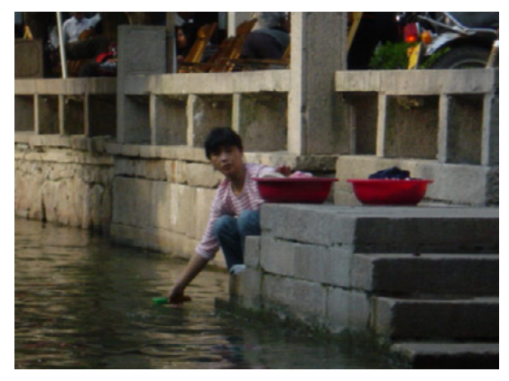
A woman washing clothes in a canal, Zhouzhang Jiangsu.

labor law, feminist rights, and occupational health. In addition, CWWN owns a bus that caters to migrant women in Shenzhen and the Pearl River Delta economic zone. 18 This is a great aid to migrant workers, who have no other means of transport, especially if they are hunting for better job upgrades across cities. In 2000, the Chinese Working Women Network began factory training for production workers. They built a model of education for workers' empowerment with a curriculum focusing on labor rights, corporate responsibility, safety, health, and