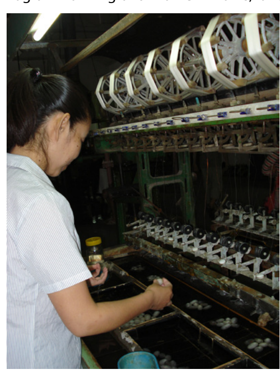
A Chinese woman workign in a factory in Suzhou.

Education remains one of the most important facets of Asia Foundation's work. In 2005, the NGO created the Scholarship Program for Migrant Women Works, and