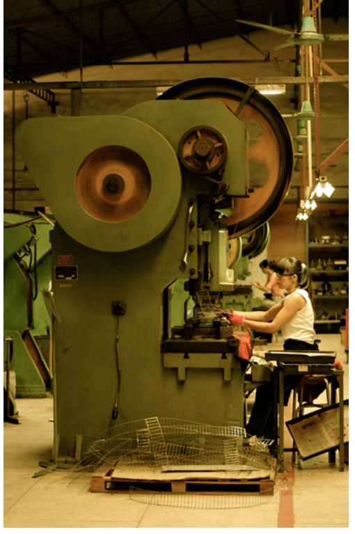
A knife factory in Guangzhou where women work arduously.

to leave and begin new lives in the cities. These "new lives" are often very difficult. As author Leslie Chang points out, "The city does not offer them easy living. The pay for hard labor is low – often lower than the official minimum wage...Get hurt, sick, or pregnant, and you're on your own.5 Chinese women, after "empowering themselves", begin at the bottom of the capitalist pool. This situation is far from ideal, and we must endeavor to procure different options for women to become truly empowered in the workforce.